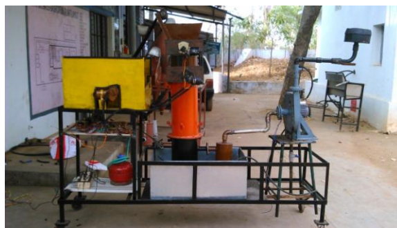
Figure 1: Fabricated and Erected 2 kW Gasifier

The biomass fuels are stored in the fuel bunker and feed it in to the furnace through the hopper and the conveyor. The fuel is fired with the help of air nozzle and the forced draft fan is switch on to absorb producer gas. Depending upon the application, the producer gas is fed in to the furnace or the generator (Power Generation).