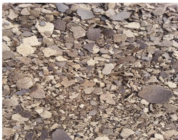
Figure 2: Drying Process of Jatropha Seed Cake

The main fuel from the proposed system is Jatropha seed cake, primarily the Jatropha seed cake was collected from the oil mills. And dry it in to the atmospheric temperature or the dryer at the level of moisture content maintained as 5 %, 10 %, 15 % and 20 %.