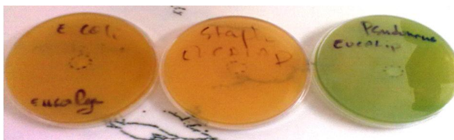
Figure 2 : Aromatogram of the Eucalyptus globulus .

The aromatograms of the E.coli , P. aeruginosa and S. aureus strains are shown in figures 2 and 3, it is clear that zones of inhibition caused by the essential oils of E. globulus and R. officinalis .