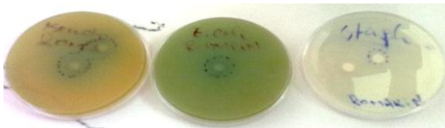
Figure 3 : Aromatogram of the Rosmarinus officinalis .