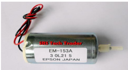
Fig.3. Permanent magnet generator