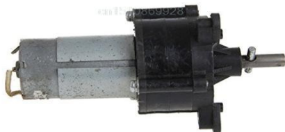
Fig.4. Generic wind power driven DC generator