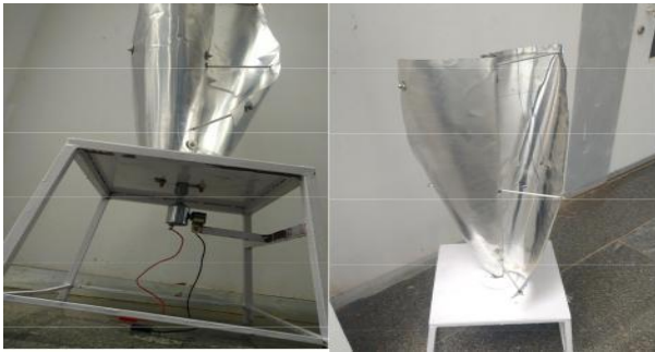
Fig.1. E 3 Wind Turbine Model

structure to stand still are used. The blades are bent at semi-circular shape at the bottom 180° and are at uniformity-straight at 180° to the corresponding blades on the top. (Fig.1-Fig.4)